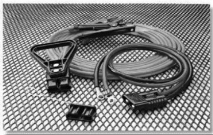
HRPJM304 ~ $146.