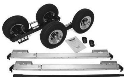
ITD2478 ~ $1250