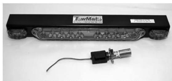
HRPTM-21WTB ~ $325