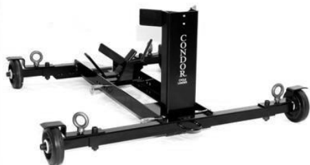
HRPCL1000 ~ $440