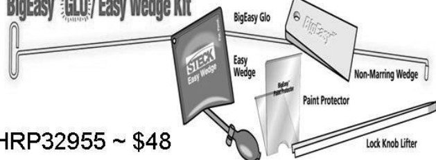
HRP32955 ~ $48