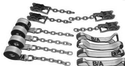
BAP38-200C ~ $148