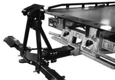
ITD1253 ~ $1050